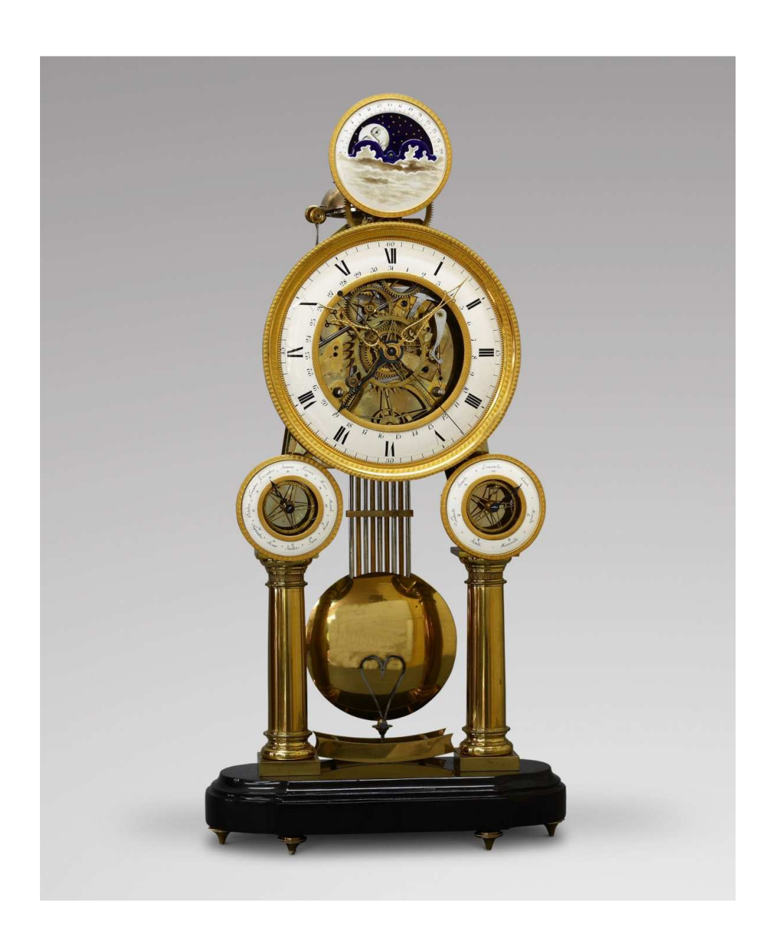
H. 24" (61cm),