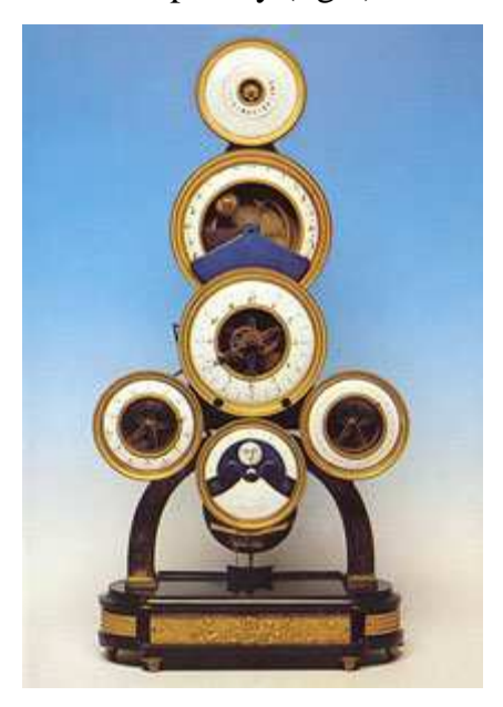
Fig.1 Six-dial skeleton clock by Hubert Sarton, dated 1795 H. 81 cm (31.9 in)

Among his major timepieces, we cite the exceptional skeleton clock dating from 1795 – an undisputed masterpiece of late eighteenth-century horology. Besides its aesthetic and technical qualities, this six-dial clock has a rather remarkable strike mechanism that is unusual in its complexity (fig.1).