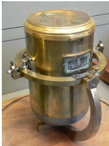
Fig.4. Ferdinand Berthoud, Chronometer N° 24, 1782

About the same time in France, Pierre Le Roy (1717-1785) invented in 1748 the detent escapement characteristic of modern chronometers. In 1766, Pierre Le Roy created a revolutionary chronometer that incorporated a detent escapement, the temperature-compensated balance and the isochronous balance spring: Harrison showed the possibility of having a reliable chronometer at sea, but these developments by Le Roy are considered to be the foundation of the modern chronometer. The innovations of Le Roy made the chronometer a much more accurate piece than had been anticipated. (fig.3).