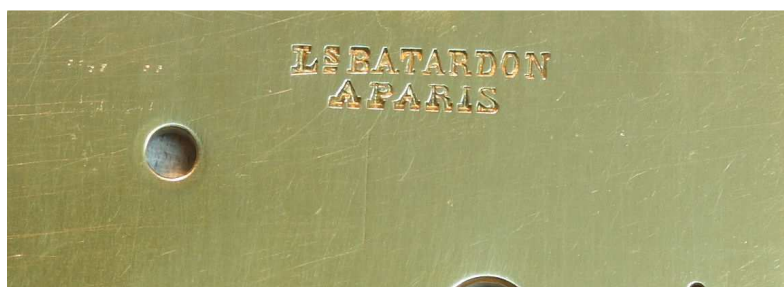
Ebauche manufacturer's mark on the inside of the rear plate

The movement with Maltese crosses on all barrels, allowing for better timekeeping, the silvered platform with English-type crabtooth escapement and cut bi-metallic balance wheel. Single-rack half-hourly French strike on a blued steel gong, with repeat button on top of the case. Alarum on the same gong. Ebauche movement from Louis Batardon (established rue Castex in Paris, circa 1870). Autonomy 8 days.