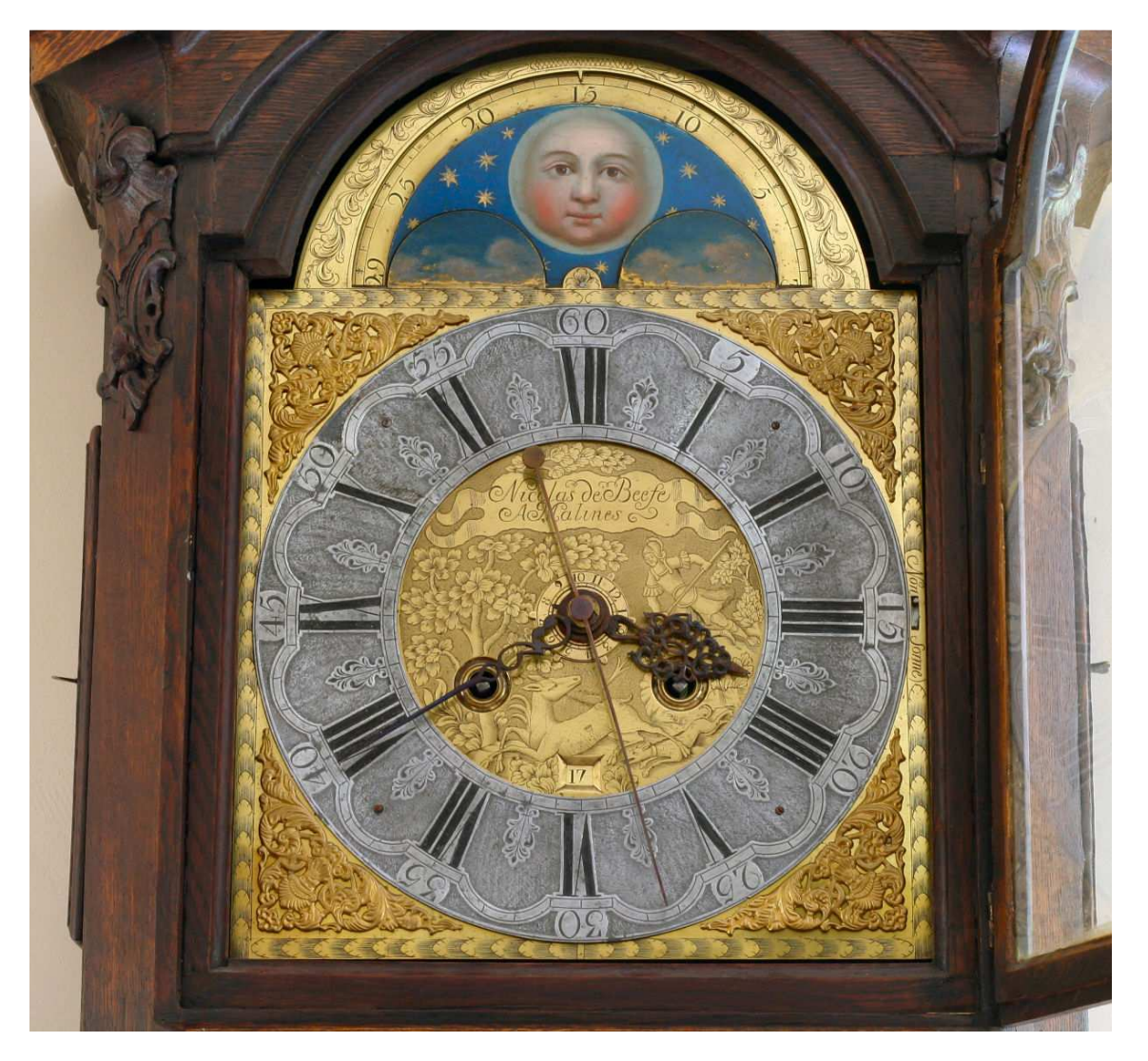
Detail of the dial

Note the extraordinarily fine engraving and the center-sweeping seconds hand.