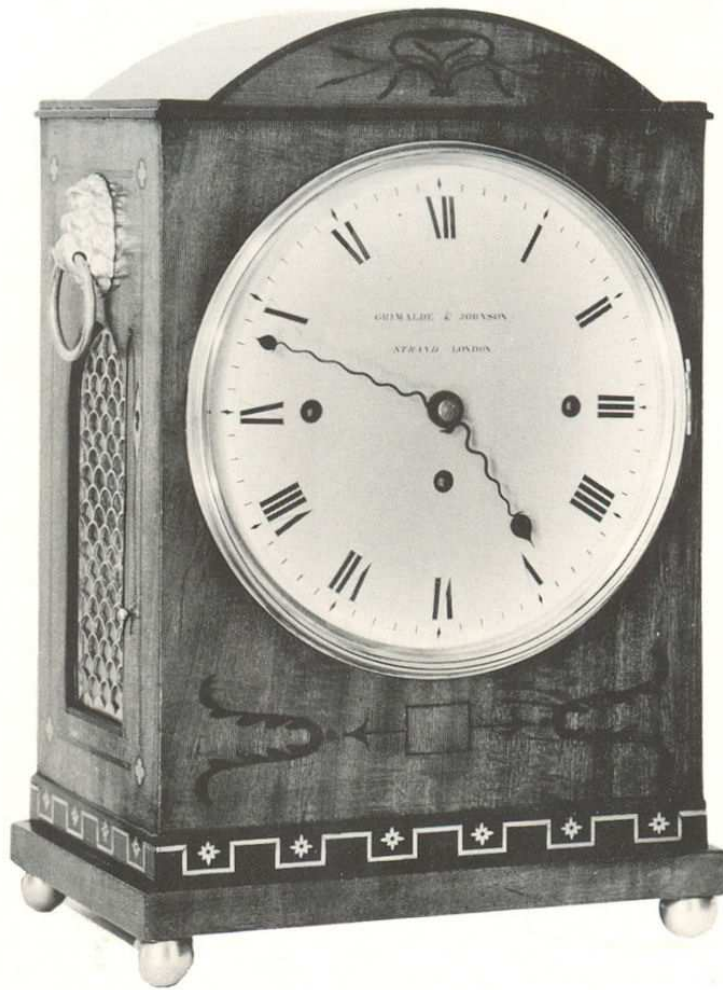
Grimalde & Johnson H: 16.5 in circa 1825