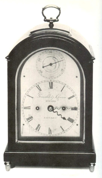
Grimalde & Johnson H: 10 in. circa 1820