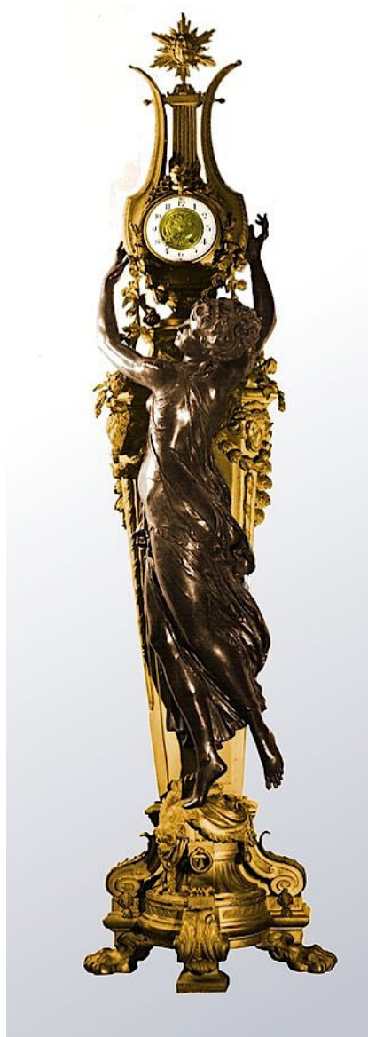
Fig. 1. Large Louis XVI-style clock, made by the company Lemerle-Charpentier Musée d'Art et d'Histoire, Troyes (N° inv. 894.15.19).