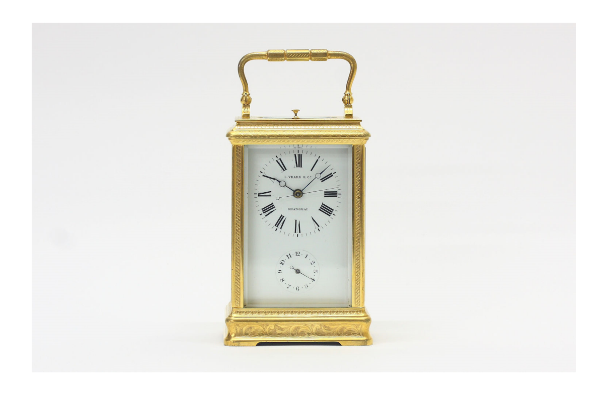
Second half of the 19th Century H. 19cm (7 ½") with handle up, W. 9,5cm (3 ¾"), D. 8,5cm (3 ¼") Signed L.Vrard & Co, Shanghai