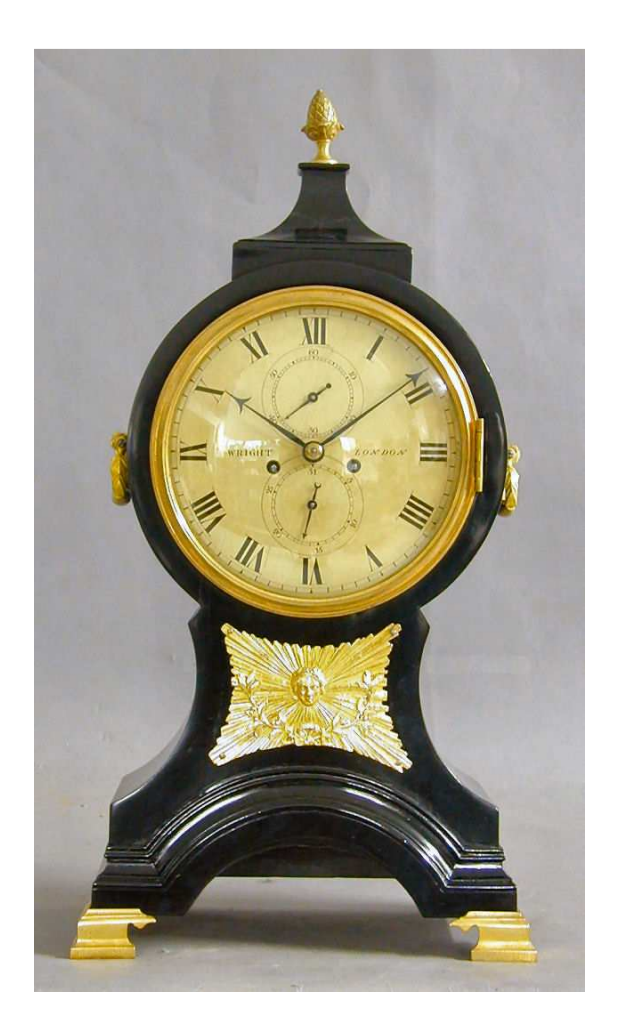
Circa 1780 H. 54 cm (21.3 in)